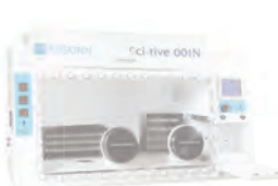
SCI-TIVE Total In Vitro Environment Our Most Advanced Workstation Imaging ready system, also features HEPA filtration