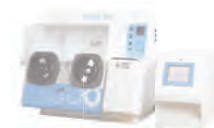
INVIVO 2 300 Compact Workstation - Larger Interlock